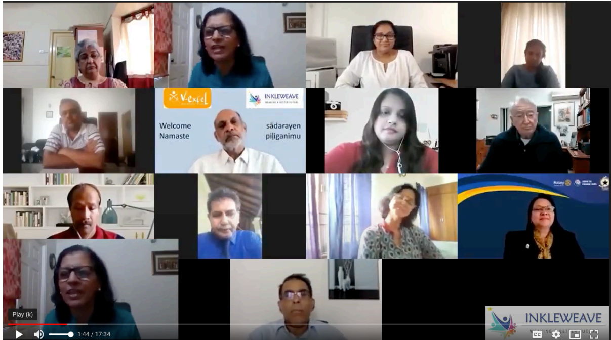
Image shows the Launch event, held electronically

The project is training 38 professionals in the leading children’s hospital in Colombo – Lady Ridgway – who will qualify as master trainers and go on to train resource personnel in the Rural and Suburban areas of Sri Lanka, in identifying, assessing and creating interventions for autistic children and children with other developmental disabilities, reaching over the whole country in time.