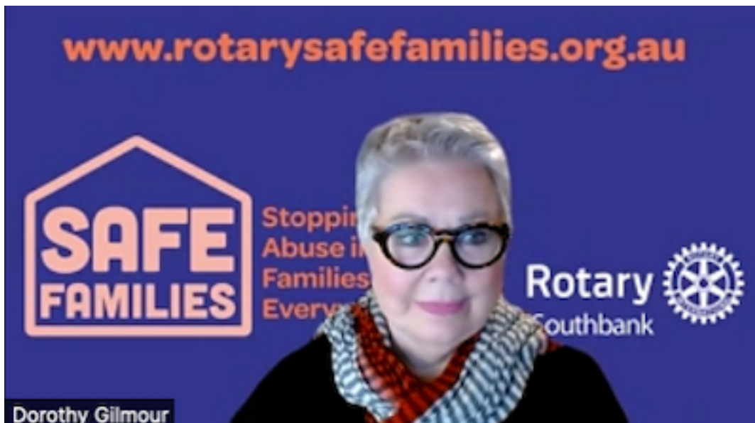
One of the Co-Founders speaking on Zoom

Customisation would make an excellent District level project too. Why not spread the word in your District?